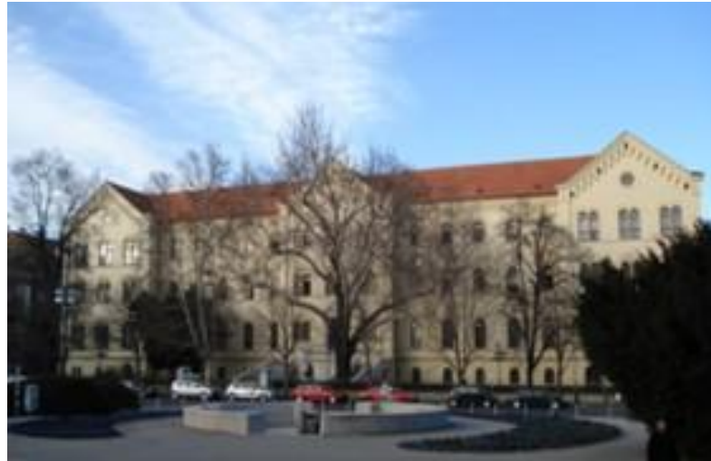
University of Zagreb