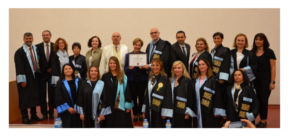
Upcoming Event: IV. Pharmacy Education and Accreditation Congress

Ceremonies were organized at which the members of the ECZAKDER Board of Directors presented accreditation certificates to ten pharmacy faculties from different parts of Turkey. With these ceremonies, which is one of the activities that ECZAKDER is most proud of, the Faculties of Pharmacy of Turkish Universities Accredited in Pharmacy Education were honored with certificates. Among them were Istanbul University, Yeditepe University, Erciyes University, Marmara University, Ankara University, Atatürk University, Ege University, Anadolu University, Hacettepe University and Gazi University.